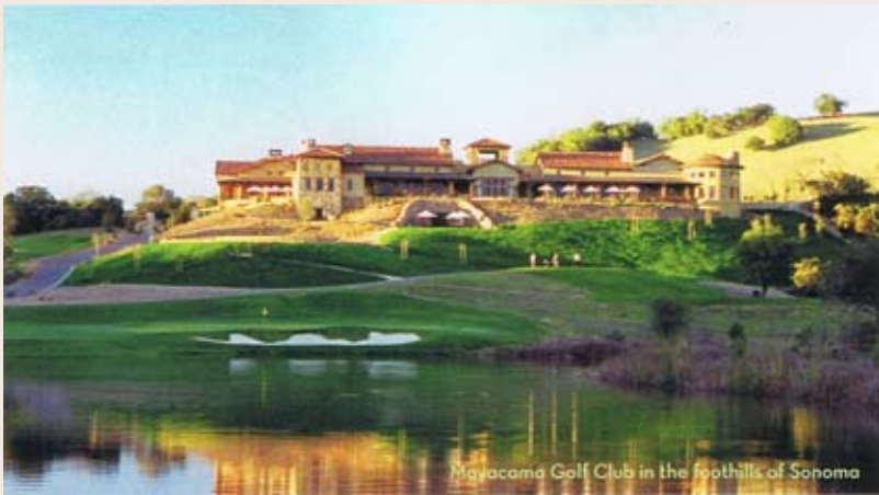
Mayacama Golf Club in the foothills of Sonoma