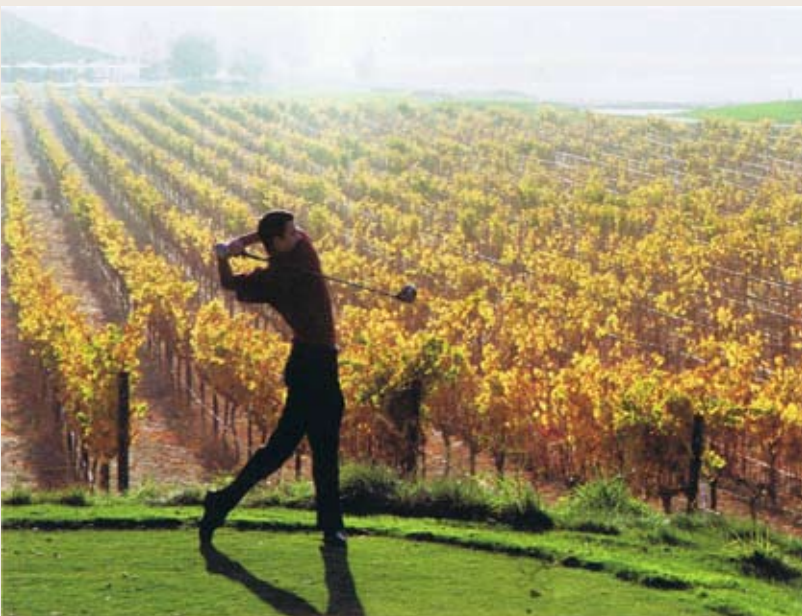
The Course at Wente Vineyards in Livermore Valley

Private clubs celebrate the marriage of golf and wine by bestowing special privileges on their members. Mayacama in the Sonoma foothills offers members a walking-only course designed by Jack Nicklaus and a program with local wineries.